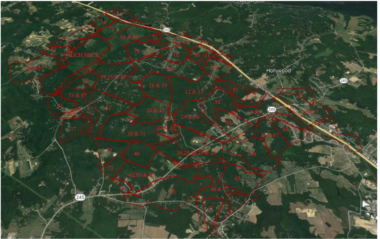
Beaverdam Manor Confiscated British Property 1781 (S1567-23 Division Plats 4-53)