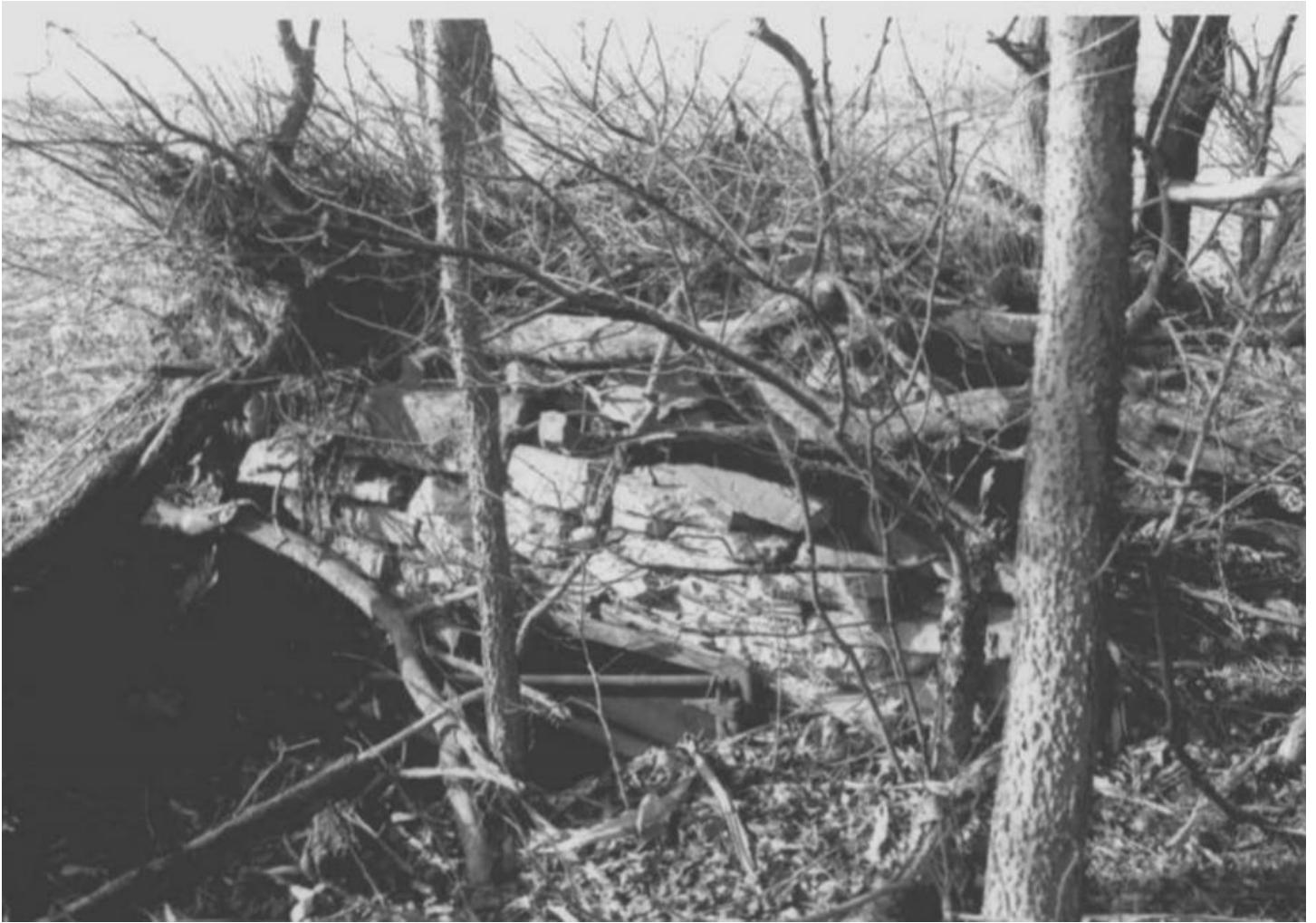
Fieldstone Mausoleum with Cast Iron Door

(Maryland Inventory of Historic Properties (MIHP) F3-113 Joseph Cronise Farmstead)