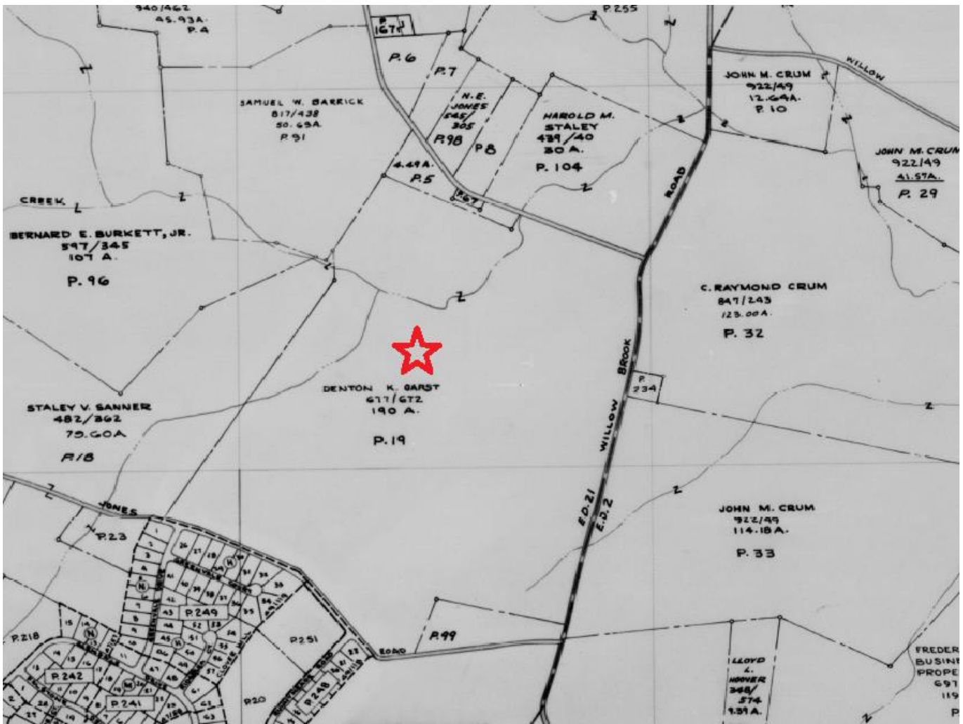
1977 Frederick County Property Tax Map