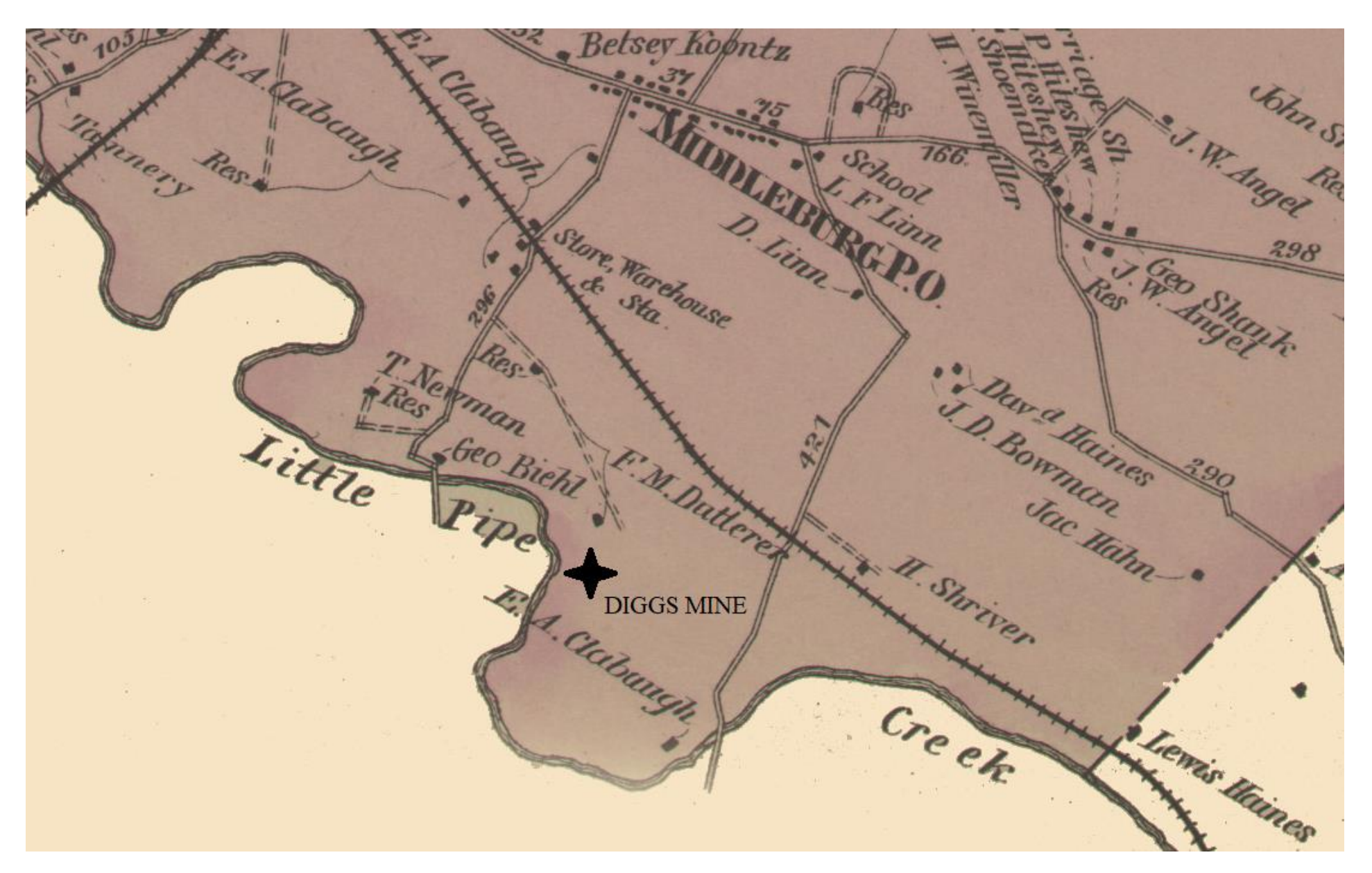
1877 Middleburg District No. 10