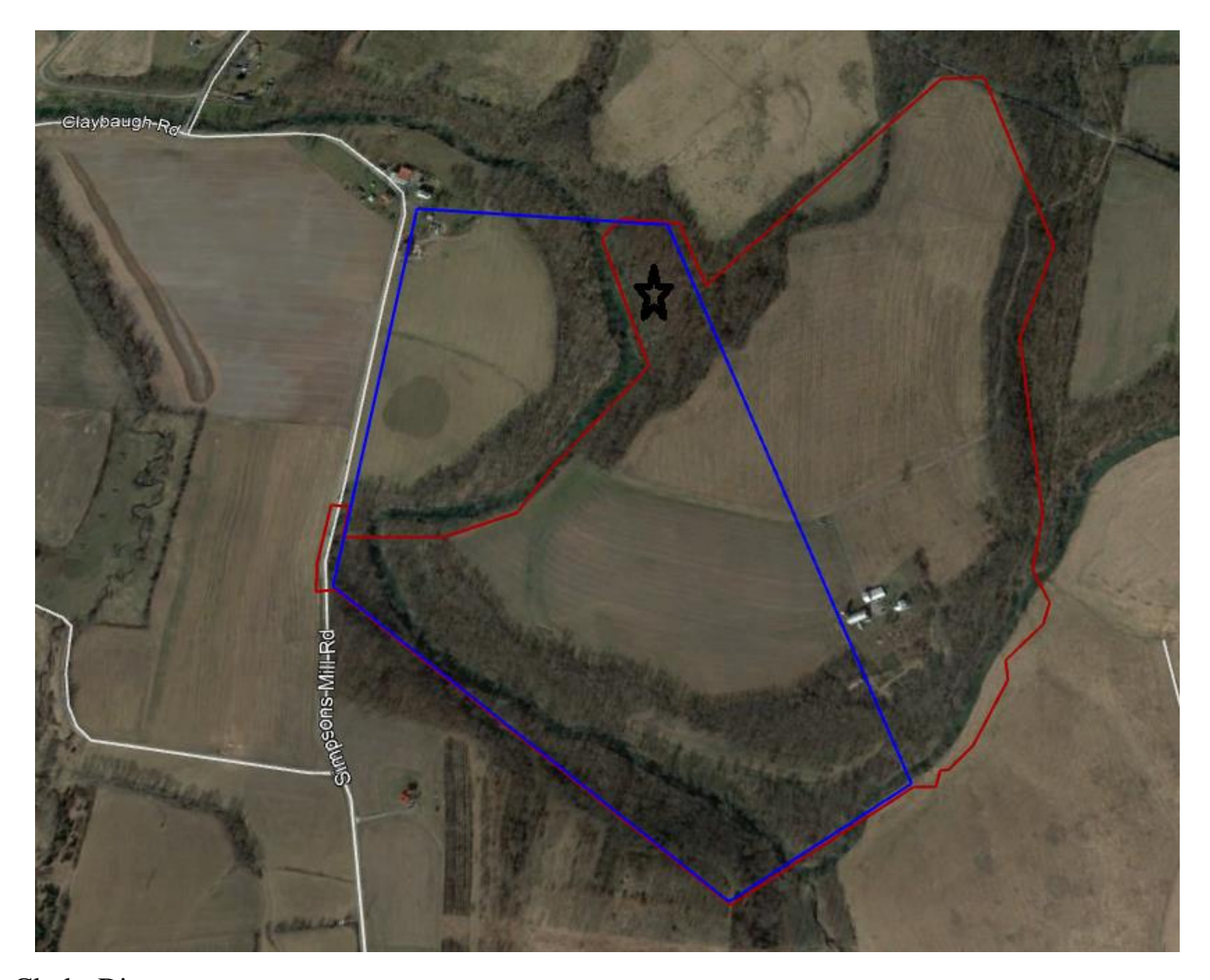
Blue Outline-Clarks Discovery Red Outline-Daniel S. Repp Property (Carroll County Deed 66-283) Star-Diggs Copper Mine