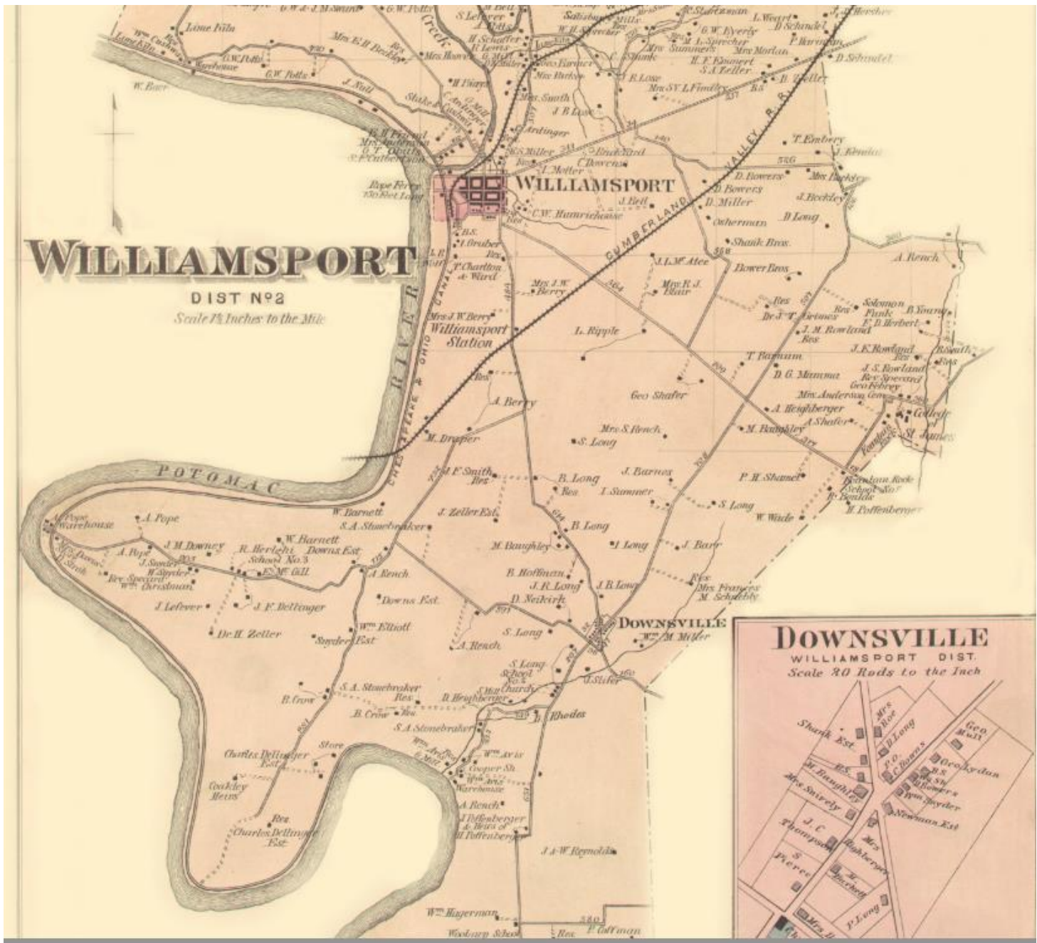
Washington County Maryland Election District No. 2